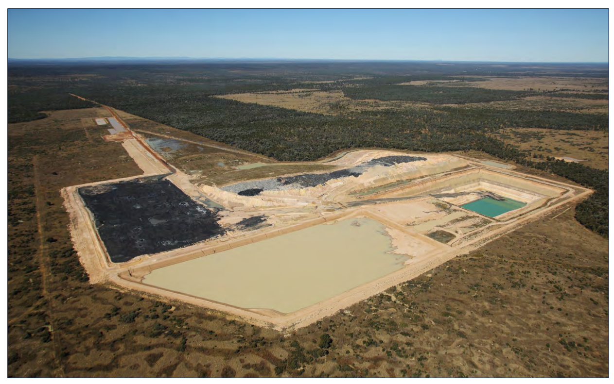
Alpha Coal Mine test pit, Queensland, Australia.

not threaten their integrity,"<sup>87</sup> which reflects a recognition that states are responsible for preventing harms from activities outside the boundaries of the properties. As the International Union for Conservation of Nature has stated, extractive projects outside World Heritage properties "should not, under any circumstances, have negative impacts" on the outstanding universal value of the properties. <sup>88</sup> To prevent negative impacts, such projects must be "subject to an appropriate and rigorous appraisal process" prior to the grant of licenses. <sup>89</sup> The appraisal should specifically assess the likely effects of the development proposal on the outstanding universal value of the property, including "direct, indirect and cumulative effects." <sup>90</sup> For example, in 2013, the Committee requested Australia ensure that the strategic assessment of the Great Barrier Reef World Heritage Area that Australia was preparing at the time "fully address direct, indirect and cumulative impacts" on the Reef. <sup>91</sup>