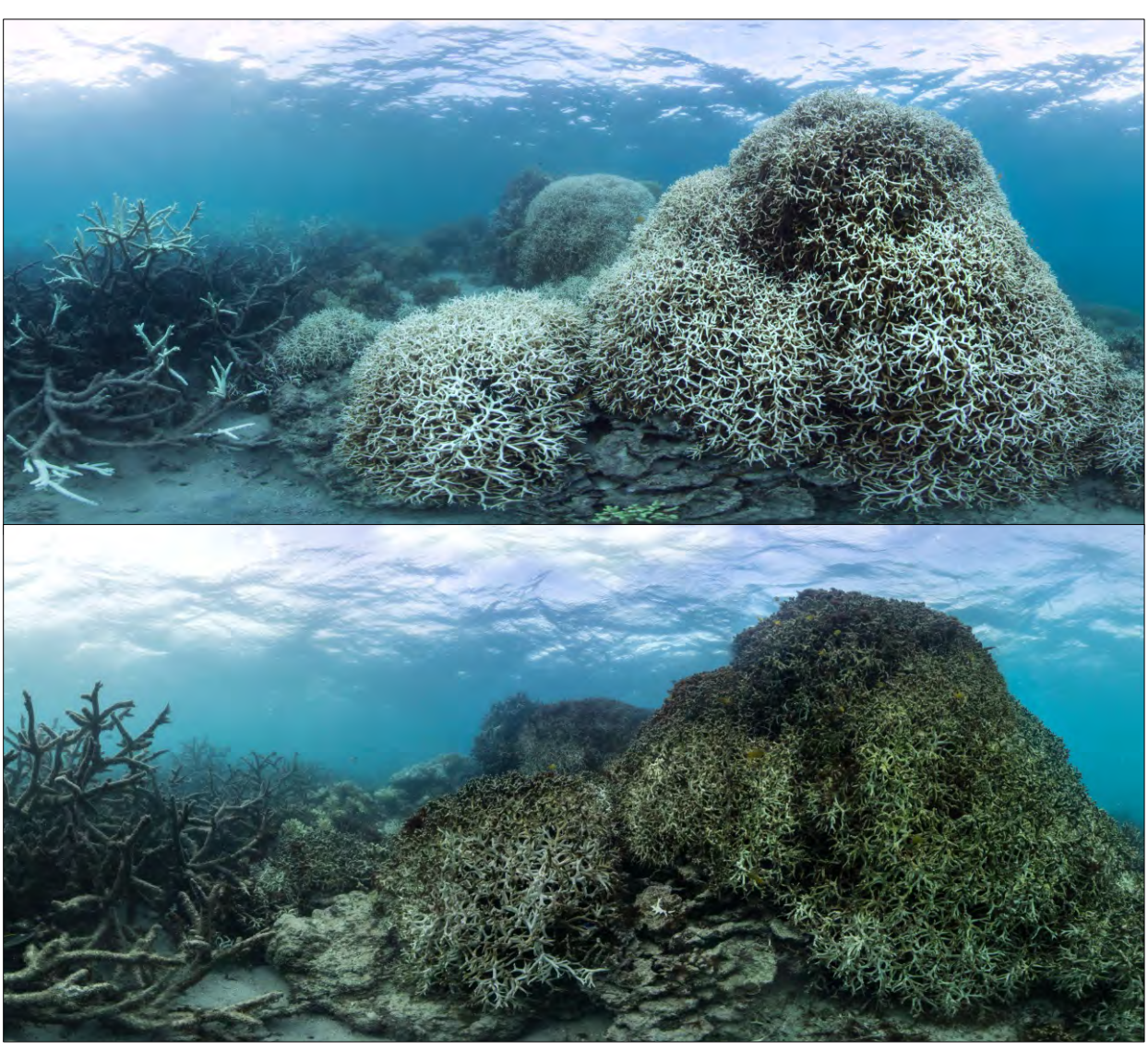
Coral bleaching, March 2016 (top), and dead coral, May 2016 (bottom), Lizard Island, Great Barrier Reef.

Despite this obligation and the critical vulnerability of the Reef to climate change, Australia is failing to meet its obligations to protect the Reef.