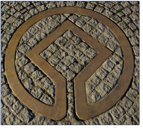
World Heritage site symbol in Bath, England. http://meandmysansar.blogspot.com

However, the Convention does not leave the protection of world heritage to the international community alone. Instead, the Convention places the primary responsibility for protecting and conserving each World Heritage property on the state where that property is situated, <sup>59</sup> and requires each state to "do all it