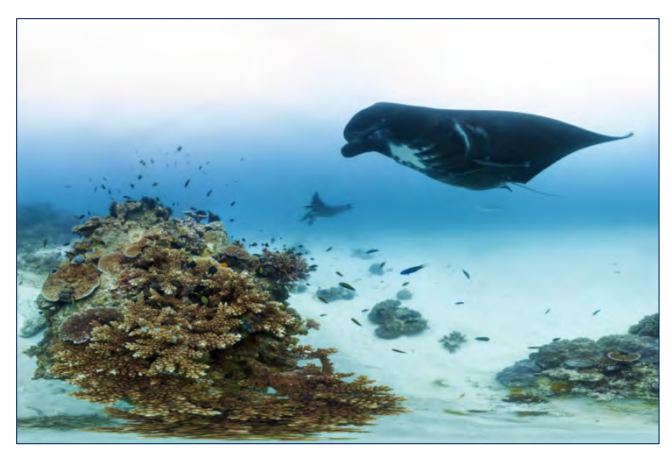
Manta Rays, Lady Elliot Island, Great Barrier Reef.

The Great Barrier Reef World Heritage Area is one of the "jewels in the World Heritage crown," 18 a "globally outstanding and significant entity ... of enormous scientific and intrinsic importance ... [and] superlative natural beauty above and below the water." 19 Stretching 2,300 kilometers, it contains 3,000 individual reefs and 1,050 islands and encompasses a globally unique array of ecological communities and habitats that are home to thousands of plant and animal species, including the iconic dugong, six of the world's seven species of marine turtle, over 30 species of whale and dolphin, around 600 coral species, over 1,600 fish species, 125 bird species, and 133 species of sharks and rays.<sup>20</sup>