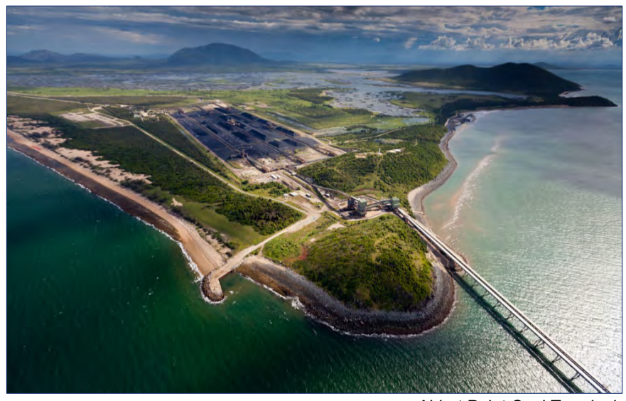
Abbot Point Coal Terminal.

First, in December 2015, the Australian government approved a dredging project to expand the coal export port at Abbot Point, which is within and adjacent to the World Heritage Area. This project, for which the Queensland government is the proponent, supports the development of a new terminal (which the Australian government approved separately in 2013). The expansion of Abbot Point Port is intended to facilitate the export of coal from the Galilee Basin, and, if developed as proposed, Abbot Point Port would be among the largest coal ports in the world: the export capacity would increase from 50 million tons of coal per year to between 85 and 120 million tons. The dredging project would require the offshore dredging of around 1.1. million cubic meters of previously undisturbed seabed within the World Heritage Area and the construction of onshore containment ponds for the dredge material and temporary pipeline infrastructure to pump this material to the ponds. The development of the new terminal would require the construction of onshore coal handling facilities, rail loops and outloading facilities, and a jetty and two ship berths.