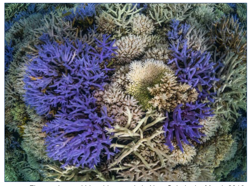
Fluorescing and bleaching corals in New Caledonia, March 2016.

The threat of climate change was made real in recent years when warming ocean temperatures caused by climate change triggered wide-scale coral bleaching around the world. From Papahānaumokuākea (United States of America) to the Phoenix Islands Protected Area (Kiribati), to the Aldabra Atoll (Seychelles), the Lagoons of New Caledonia (France), and the Great Barrier Reef (Australia), World Heritage-listed coral reefs have suffered bleaching – a process in which heat stress starves corals by destroying their symbiotic relationship with the microscopic algae that produce their food. Unfortunately, bleaching events are likely to become more frequent and devastating as seas continue to warm because of climate change.