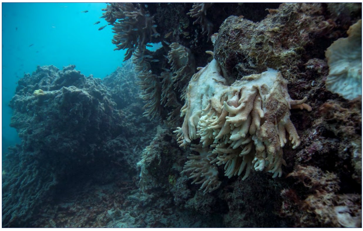
Decomposing soft coral falling off the reef, May 2016.

In the past few years, the effect of climate change on corals has been made frighteningly evident. Elevated ocean temperatures have triggered wide-scale coral bleaching events around the world, from the United States' Papahānaumokuākea Marine National Monument, to France's Lagoons of New Caledonia, the Seychelles' Aldabra Atoll, and Kiribati's Phoenix Islands Protected Area. On Australia's Great Barrier Reef, a staggering 22% of corals died in 2016 – the worst coral die-off in recorded history. In the northern third of the Reef, an area that had previously been relatively unaffected due to its distance from other human pressures, approximately two-thirds of the shallow-water coral died in just eight to nine months. On some reefs in the north, almost all the coral died.