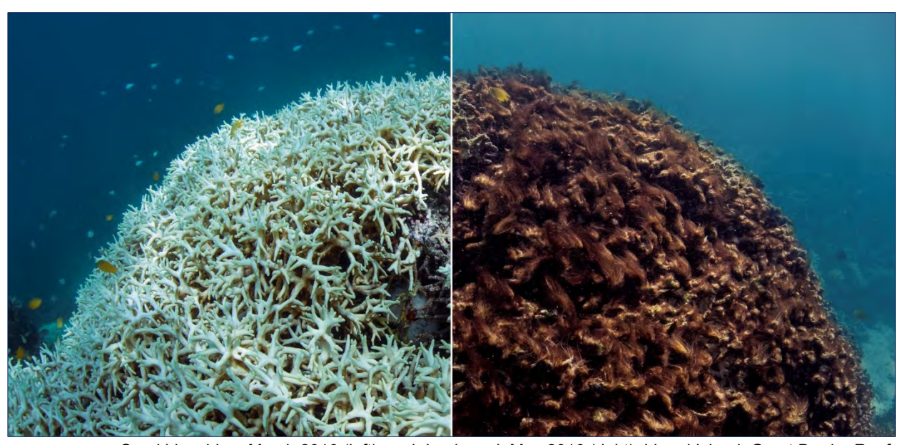
Coral bleaching, March 2016 (left), and dead coral, May 2016 (right), Lizard Island, Great Barrier Reef.

Because World Heritage-listed coral reefs are severely threatened by climate change, these principles must guide the assessment of national obligations to protect such reefs: each nation with a listed reef must do all it can, within its capacity and taking into account its contribution to climate change, to protect its reefs from the impacts of climate change. As the World Heritage Centre has recognized, the obligation of States to protect their own World Heritage properties is the "basis for States to ensure that they are doing all that they can to address the causes and impacts of climate change."